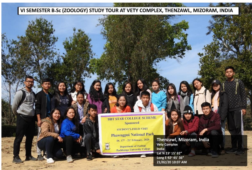
Figure: Students with faculty at one of the base camp.