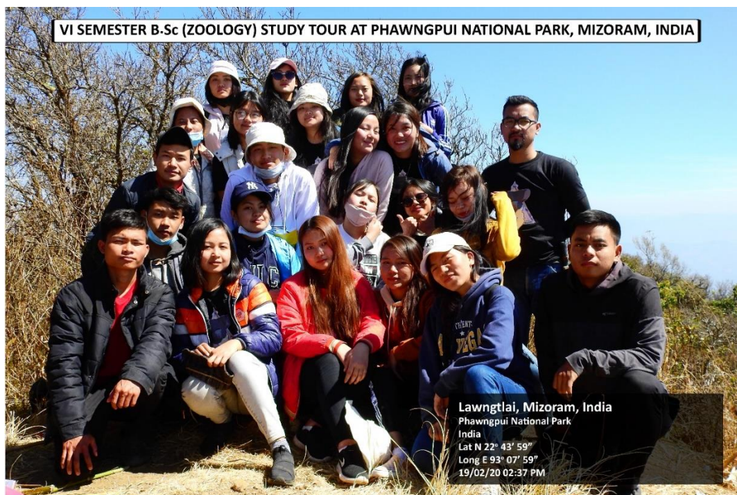
Figure: Photo at the peak of Phawngpui Tlang.