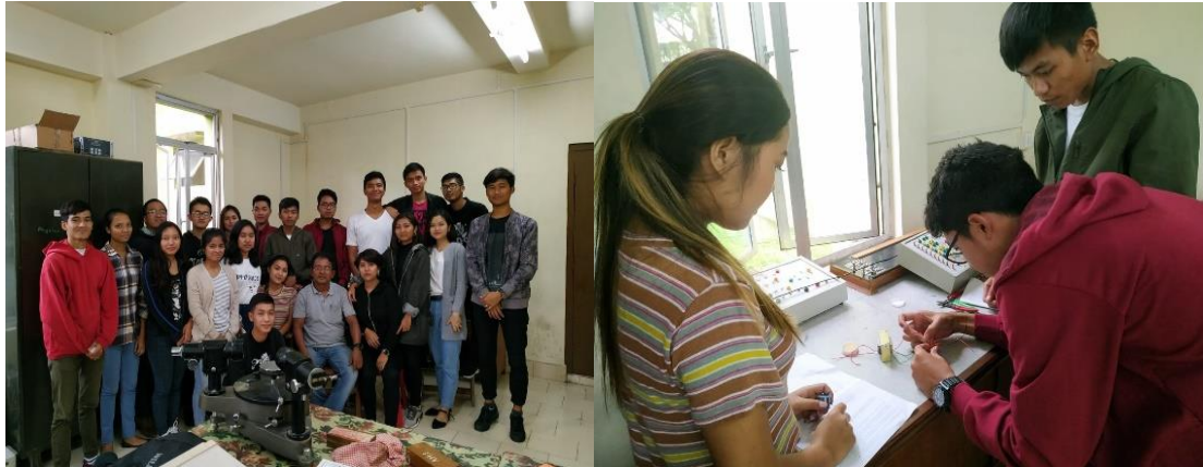
Pic 1: Students undertaking repair works