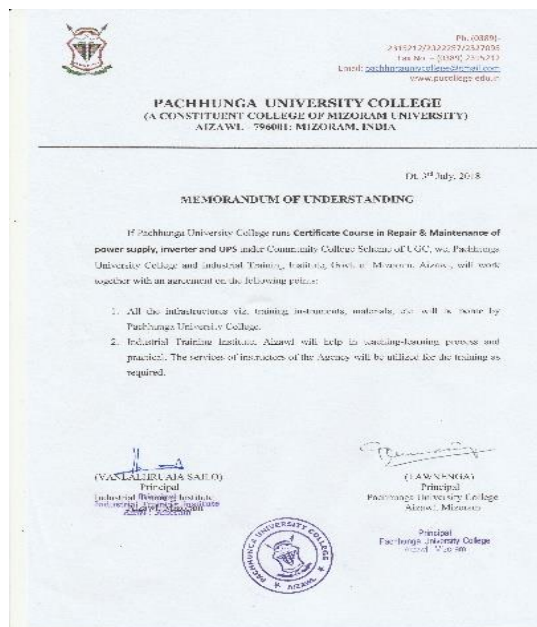
Pic 2: MOU signed with ITI Aizawl for conduct of Course.

Venue: Departmental Laboratory, Lat:23°43'3712"N, Long:92°43'298"E, Time: 1 pm