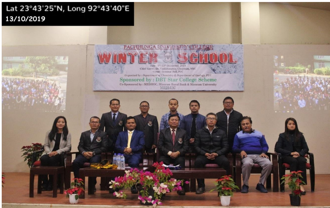
Organizers with invitees