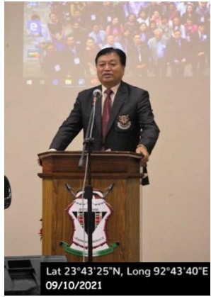
Guest of Honour