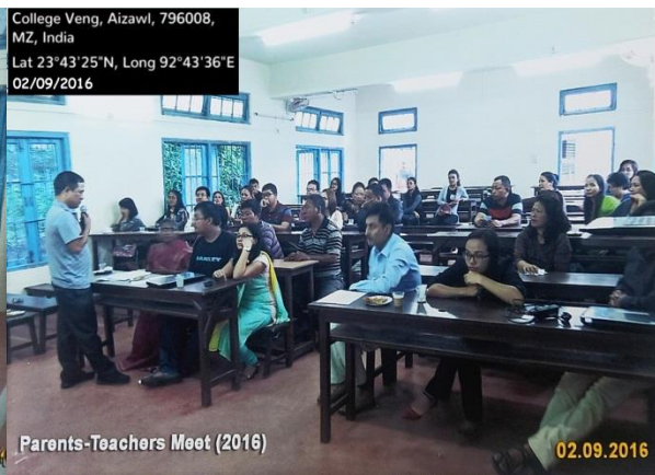
Parents-Teachers Meet (2016)

College Veng, Aizawl, 796008, MZ, India Lat 23°43'25"N, Long 92°43'36"E 02/09/2016