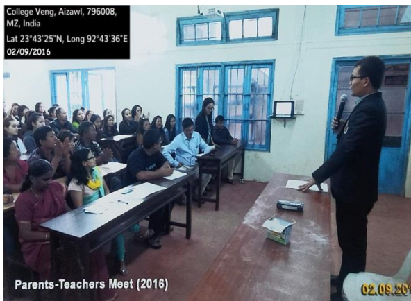
Parents-Teachers Meet (2016)

College Veng, Aizawl, 796008, MZ, India Lat 23°43'25"N, Long 92°43'36"E 02/09/2016