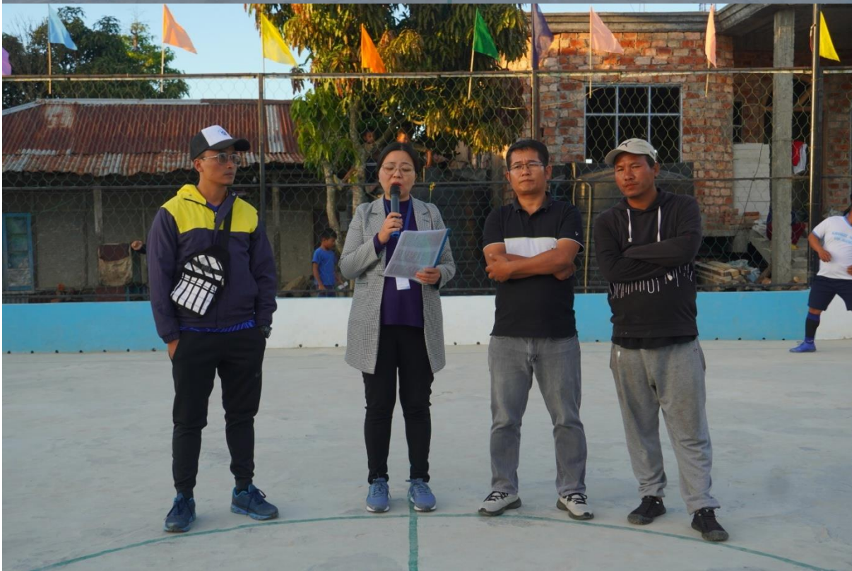
(Speech on financial literacy)