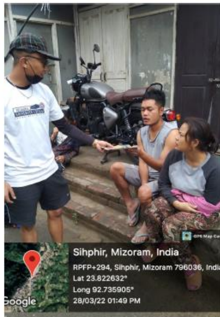
Picture: Pamphlets distribution by NSS volunteers