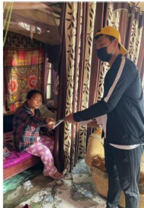
Picture: Pamphlets distributed to every house of Nausel Village