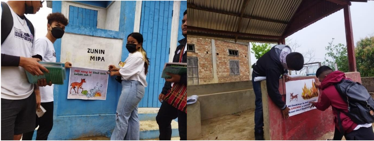
Picture: Awareness Posters pasted at different places