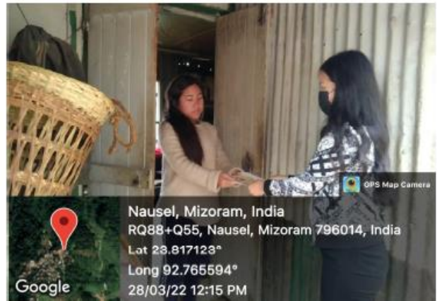
Picture: NSS volunteers distributing Pamphlets