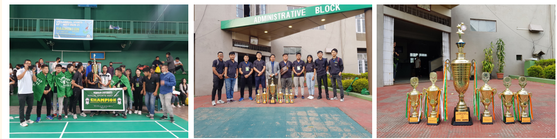
MZU SPORTS CHAMPION 2021

C. Certificate in Mizo Cultural Studies and Performing Arts: This course is conducted by the College with the aim to preserve and further develop the Mizo Culture, heritage and tradition.