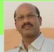
Spatial Statistics in Geographical Research Department of Geography Rajiv Gandhi University Arunachal Pradesh