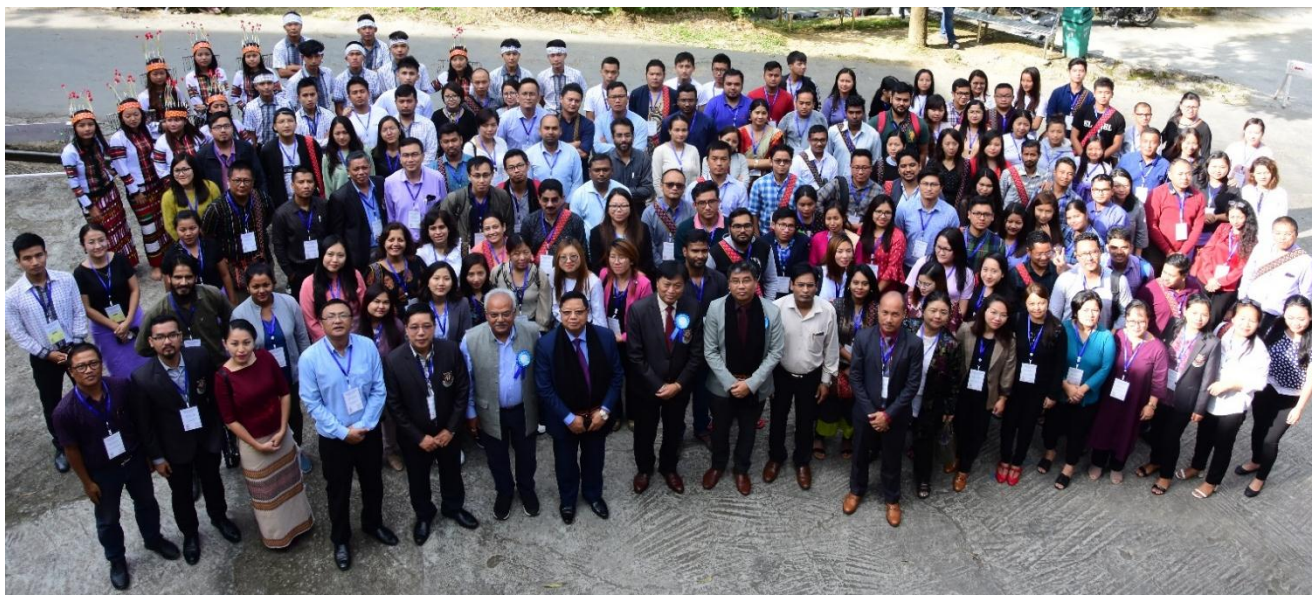
Group photo: ICRAAS2019 Inauguration 6 th November 2019