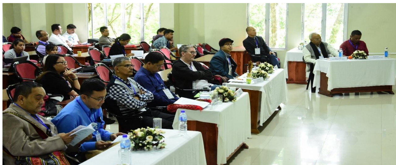
Participants during oral presentation at Seminar hall