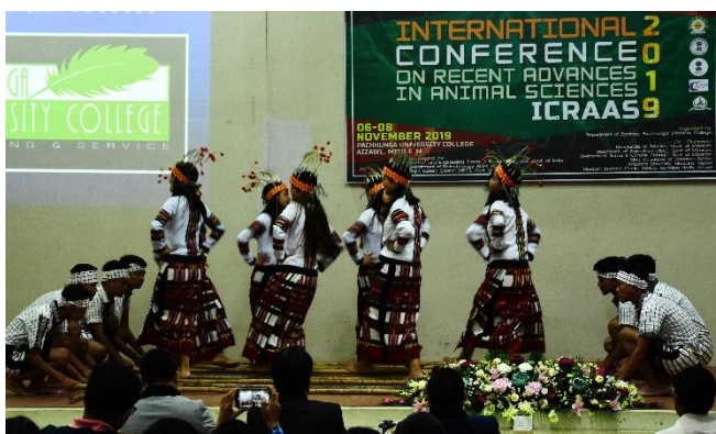
Chhawkhlel Cultural Club, PUC