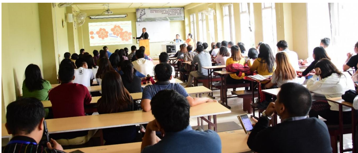
Parallel session Venue 2: Life Science Seminar hall