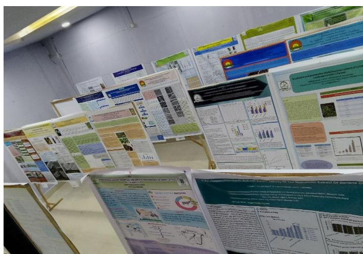
Poster Presentation room