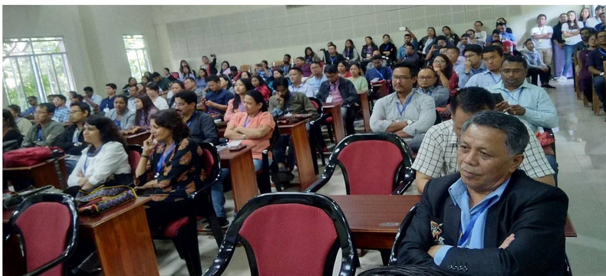
Participants during oral presentation at Seminar hall