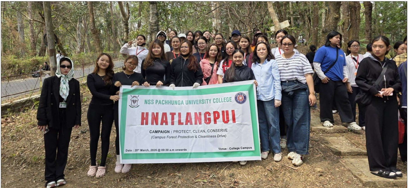
A united campus in action — teachers, staff, and students all joined hands in PUC Ram Chhan Hnatlangpui

March 20: Pachhunga University College (PUC) organised a mass voluntary work programme on Friday (20 March 2026), involving all staff and students, to prevent encroachment, misuse of land, and the outbreak of forest fires within the college campus. The initiative was named PUC Ram Chhan Hnatlangpui . Teachers, office staff, and students actively participated in the programme.