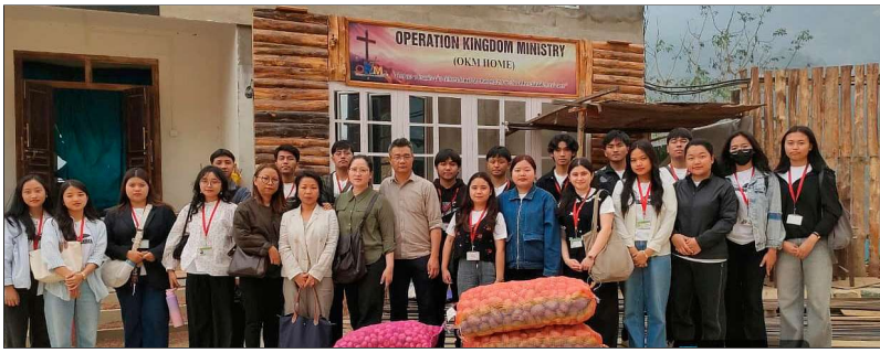
HISTORY DEPARTMENT'S VISIT TO OKM HOME