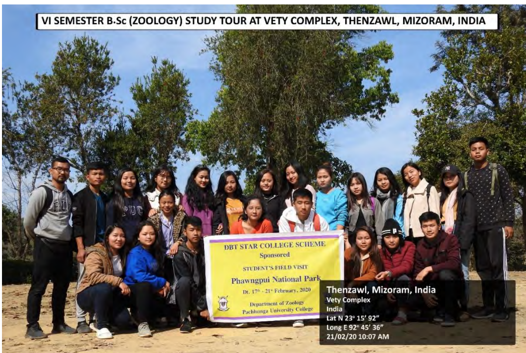
Figure: Students with faculty at one of the base camp.