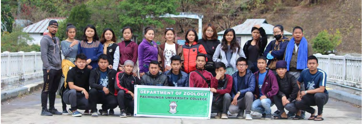
Photo: On the way to Palak Dil. Location: Kawlchaw Bridge (22.4040° N, 92.9562° E).