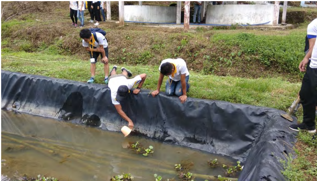
Photo: Plankton collection at Tam dil fish nursery by the students.