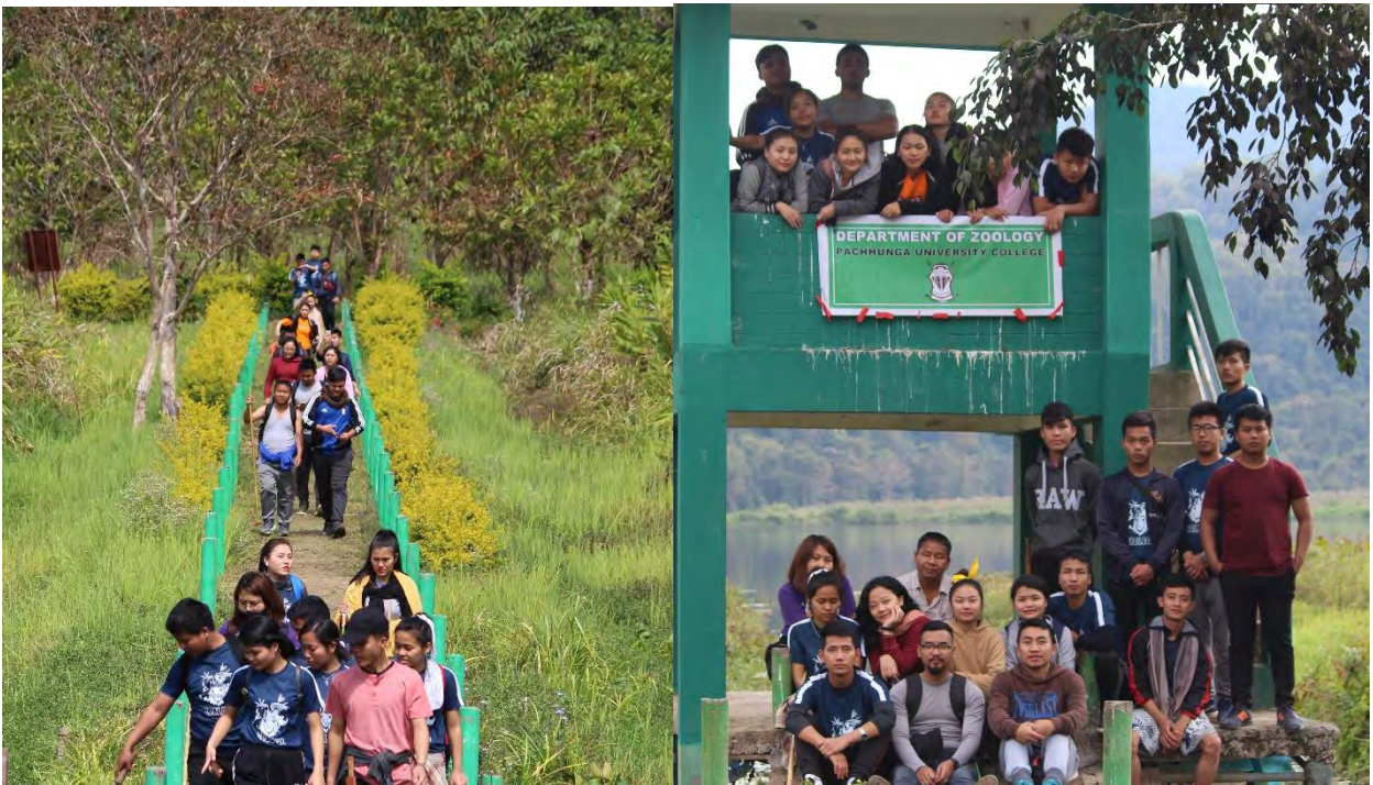
Photo: Students with faculty at Palak Dil.