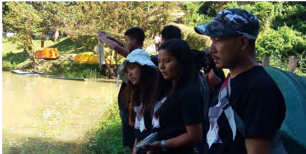
Field lecture at Tam dil by faculty.