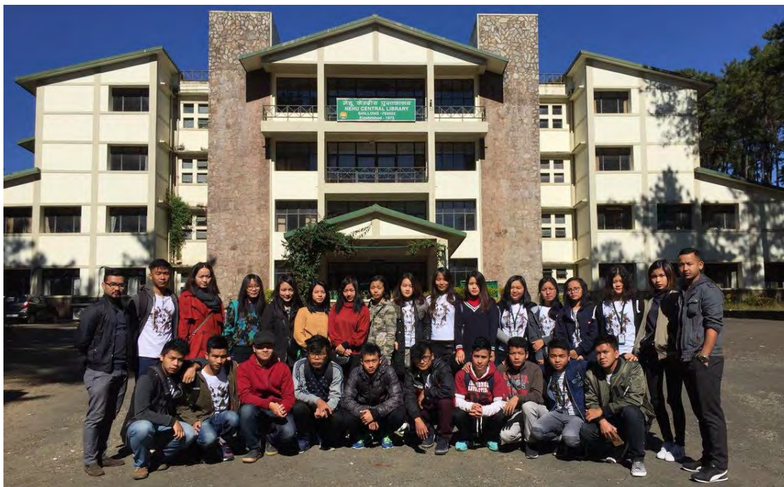
Photo: Students and faculties in front of NEHU Central Library (25.6115 N 91.8974 E)

The students were also taken to other important places of Shillong such as North Eastern Indira Gandhi Regional Institute of Health & Medical Sciences (NEIGRIHMS), one of the largest and most well-equipped hospital in Northeast India; Shillong Golf Link, Lady Hydari Park (a small zoo with various exotic fauna), Police Bazar, Bara Bazar, etc.