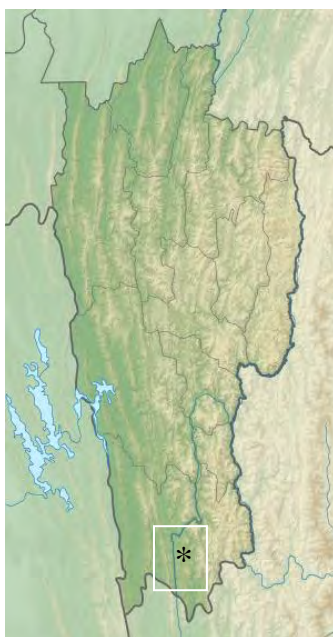
Figure 1: Mizoram map showing the location of Palak Dil.

Students made careful observations on the various flora and fauna surrounding the lake. Plankton specimens were collected for observation at the laboratory. Besides this, no other specimens were collected. However, the students got to witness many important wild plants, birds and animals in their biological habitat. Real-time on the spot lectures on the biodiversity of Palak Dil were conducted by the faculty.