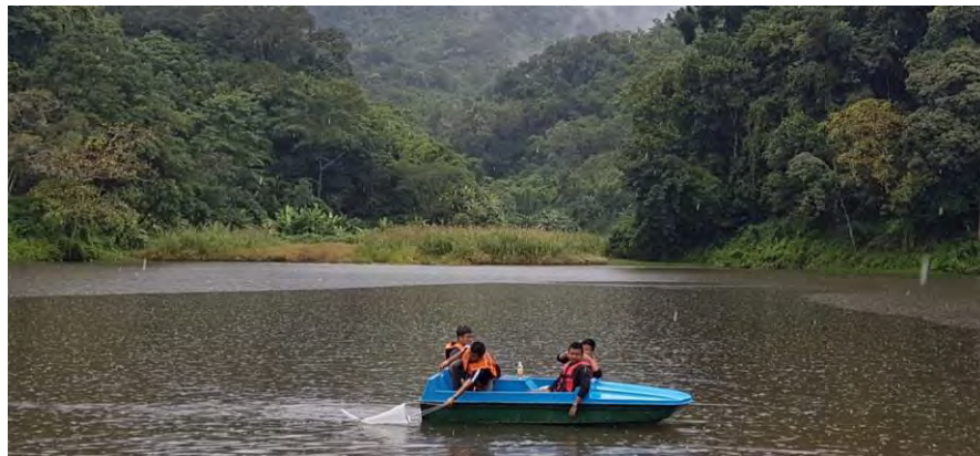
Photo: Plankton collection at Tam dil by the students.