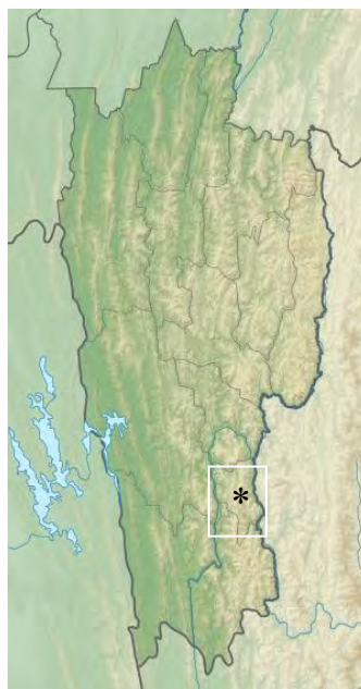
Figure 1: Mizoram map showing the location of Phawngpui National Park.

The students made careful observations on the various flora and fauna of the national park. However, no specimens were collected since no biological article must not be collected from a national park. However, the students got to witness many important wild plants and animals in their biological habitat. Real-time on the spot lectures on the biodiversity of Phawngpui National Park were conducted by the faculty.