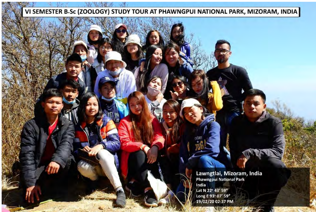
Figure: Photo at the peak of Phawngpui Tlang.