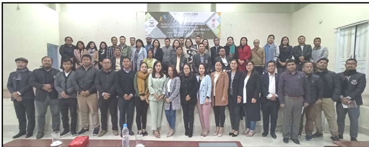
Pic.4: Group Photo. (Latitude: 23°43'25.6"N Longitude 92°43'40.8"E)