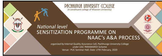
Pic.3: Banner of the program.