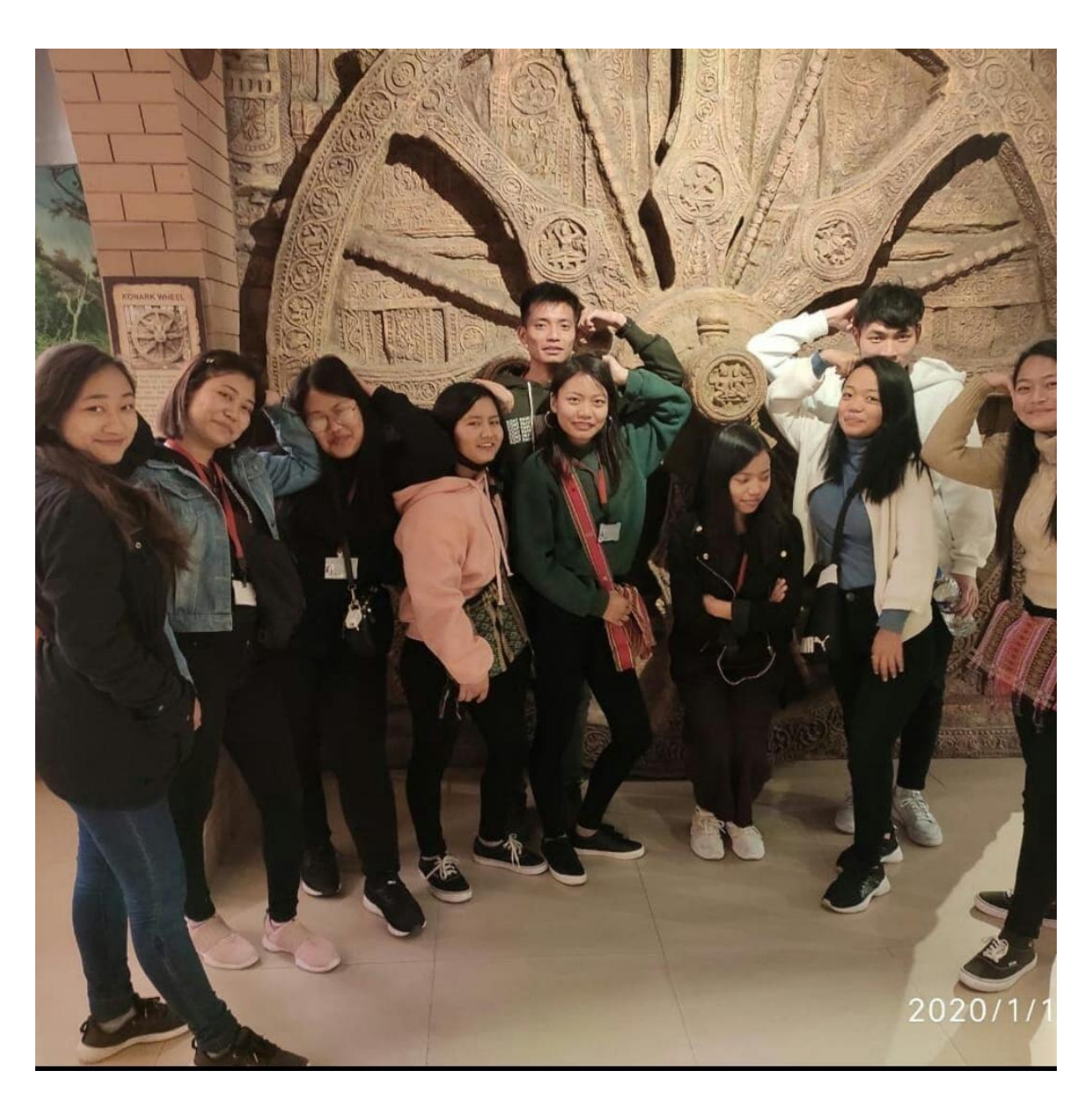
Indian Museum, Kolkata