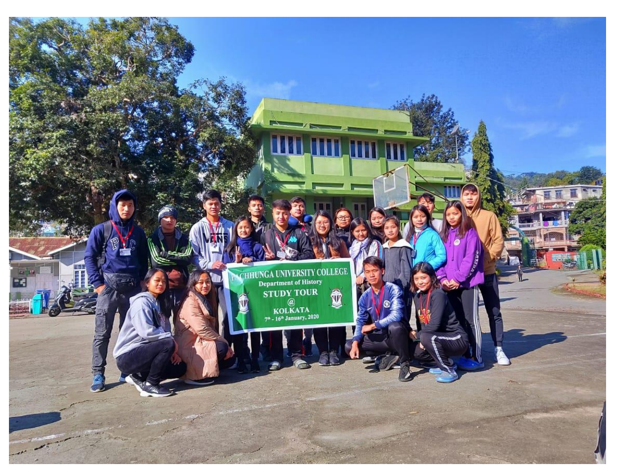
Pachhunga University College, Aizawl