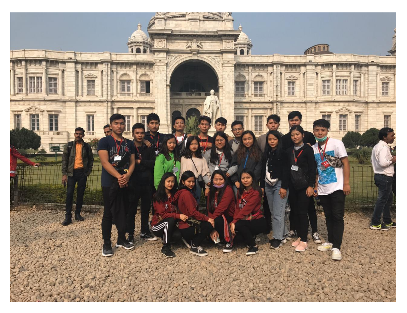
Victoria Hall, Kolkata