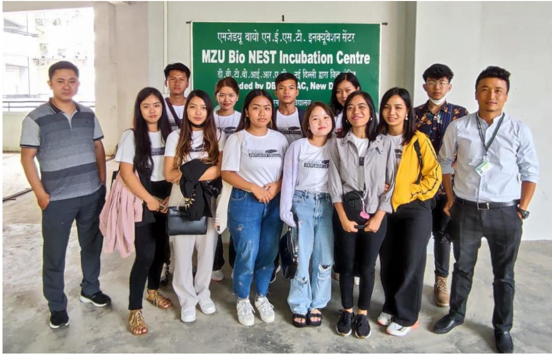
The students visited the department of Food Technology, MZU and Molecular Microbiology and Systematic Laboratory, Department of Biotechnology, MZU. The research scholars of the respective departments explained the ongoing researches and demonstrated the equipments available in the department.