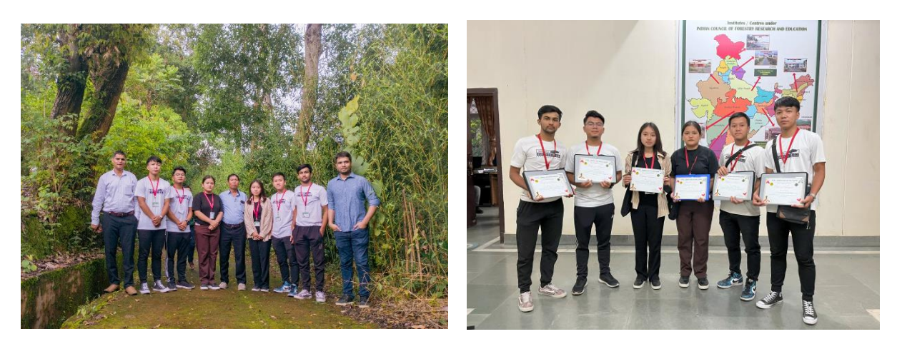
Head Department of Biotechnology