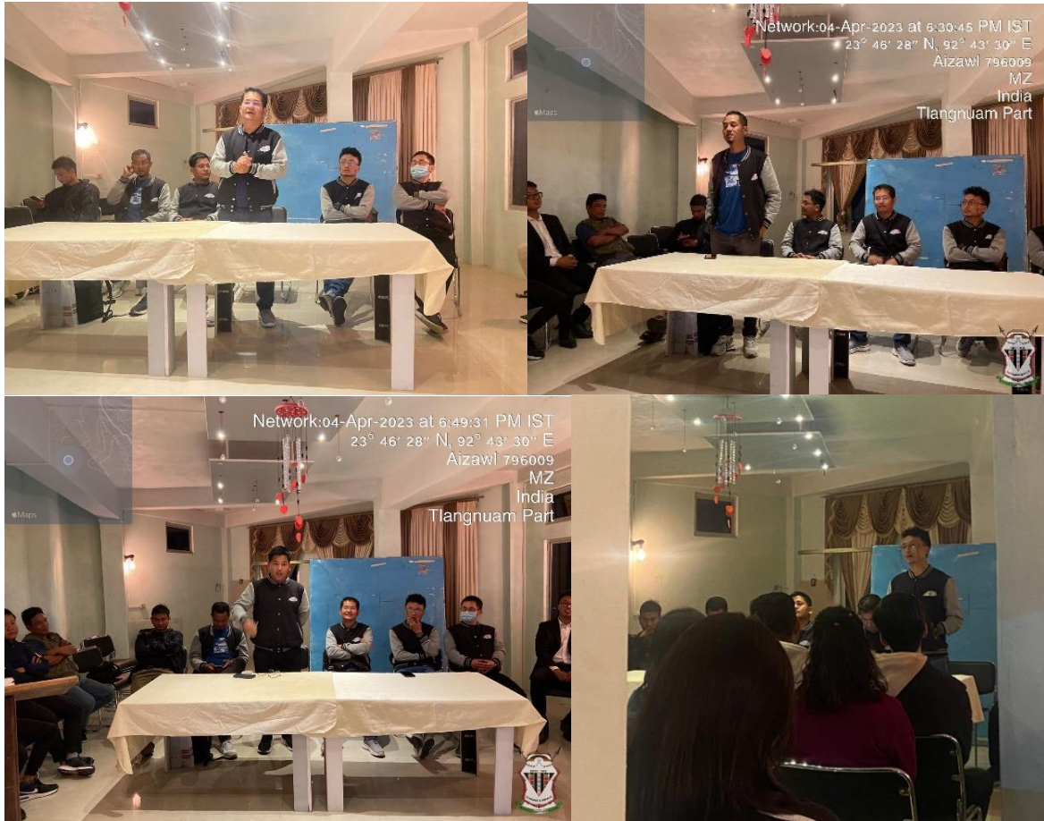
Picture6: Leadership Training a KV resort, Durtlang