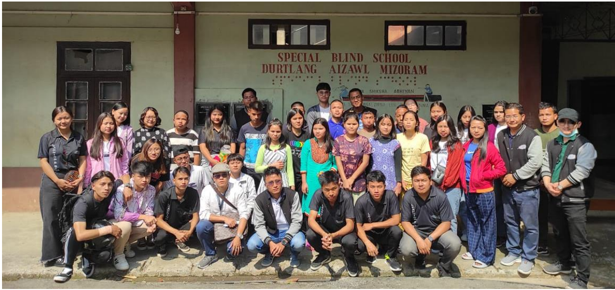
Picture2: Special Blind School, Durtlang