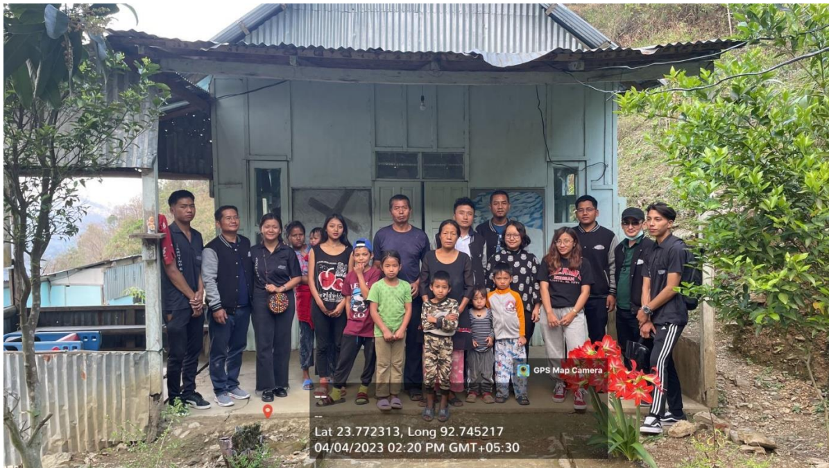
Picture4: Van Palai Camping Centre, Durtlang