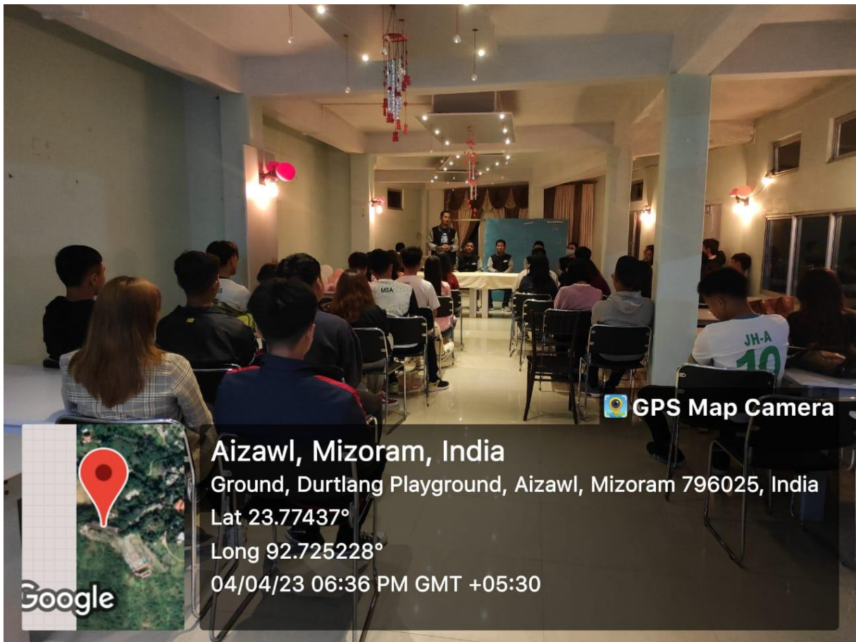
Picture5: Leadership Training a KV resort, Durtlang