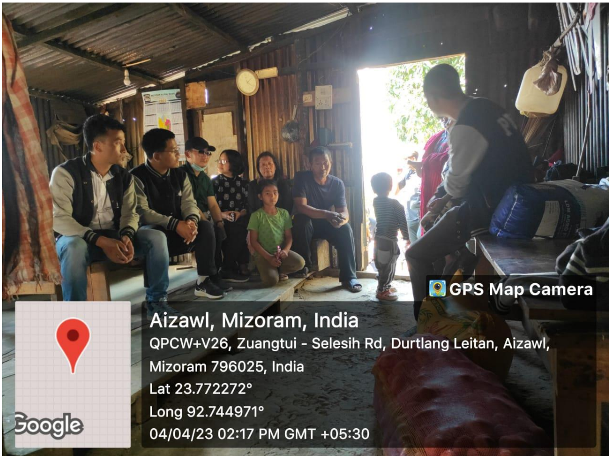
Picture3: Van Palai Camping Centre, Durtlang